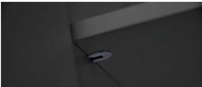
Space between shelves allow for free arrangement of binders or other documents