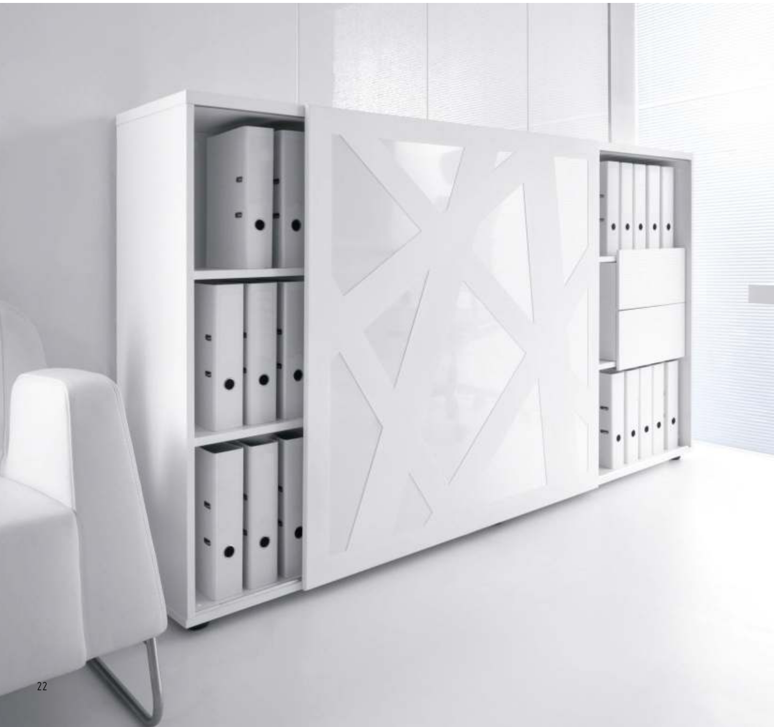
ZS01 X 1 MANAGERIAL STORAGE 2000/434/1129 ( 78 3/4" x 17 1/8" x 44 1/2" ) ZS01 X 1 ADDITIONAL DRAWER 428/385/403 ( 16 7/8" x 15 1/8" x 15 7/8" )