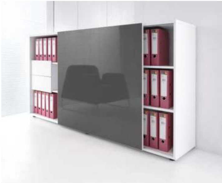
ZS02 X 1 MANAGERIAL STORAGE 2000/434/1129 ( 78 3/4" x 17 1/8" x 44 1/2" ) ZS01 X 1 ADDITIONAL DRAWER 428/385/403 ( 16 7/8" x 15 1/8" x 15 7/8" )