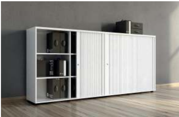
A3L06 X 2 TAMBOUR STORAGE 1200/432/1129 ( 47 1/4" x 17" x 44 1/2" )