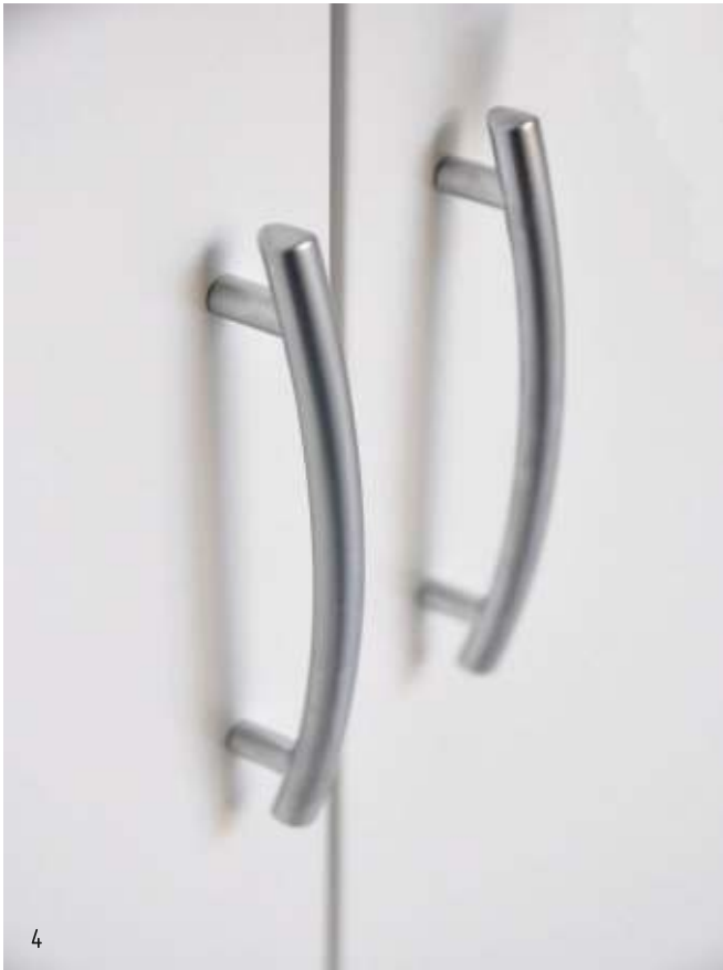
Handle — aluminium